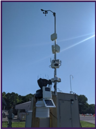
Air quality sensors

Air quality sensors are becoming popular for consumers because they are inexpensive, user-friendly, and provide real-time air pollution data. Despite the growing demand for low cost sensors, their data quality remains largely unknown. This uncertainty presents challenges when using these technologies for air quality and public health decision-making. As such, the TN Department of Environment and Conservation (TDEC) is collaborating with Metro Nashville's Air Monitoring Program to research the performance and potential limitations of these sensors.